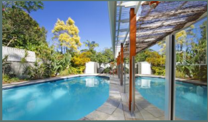
4 BED 2 BATH 2 CAR

***Auction Friday 21st November 5pm. Inspect from 4.30pm**