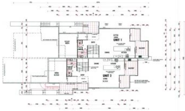
MIDDLE FLOOR DIMENSION PLAN