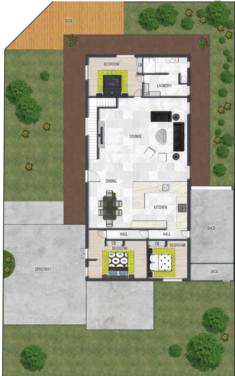
GROUND FLOOR PLAN ON SITE PLAN