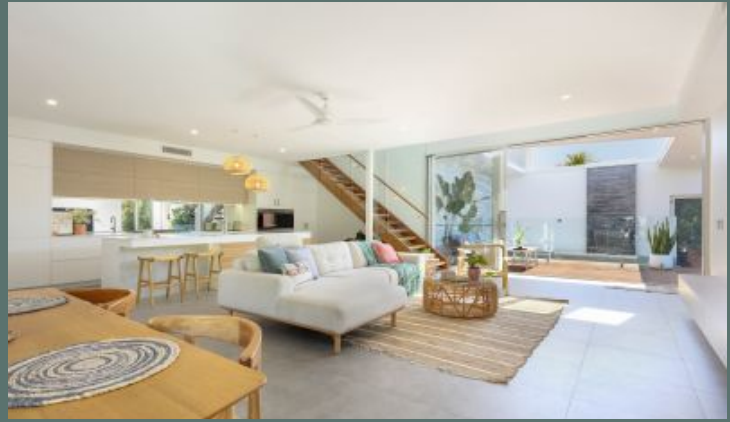
3 BED 3 BATH 2 CAR

Amber Werchon Property presents to the market 1/7 Camfield Street, Alexandra Headland. When it comes to investing in the highly sought-after Alexandra Headland beachside community, there is nothing more important than location specific architectural design and unsurpassed tailoring.