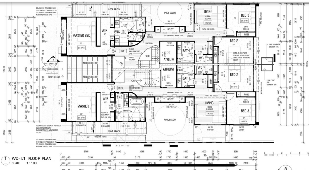
1 WD- L1 FLOOR PLAN SCALE 1 : 100