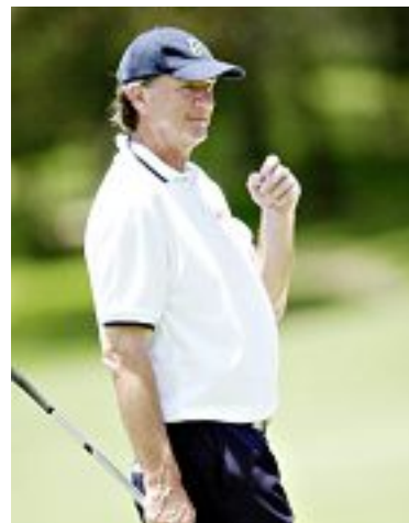
"The 17th hole at Horton Park, where I scored my one and only hole-in-one."

The keen golfer knows where to spread his ashes.