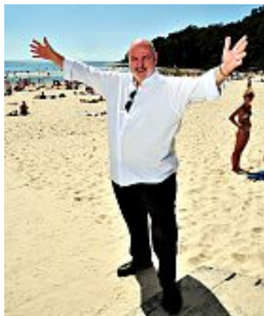
He says Australians have a great sense of humour, and it's fascinating to listen to conversations and the nicknames used.

He says he loves the honesty and non-pretentiousness of Coast people.