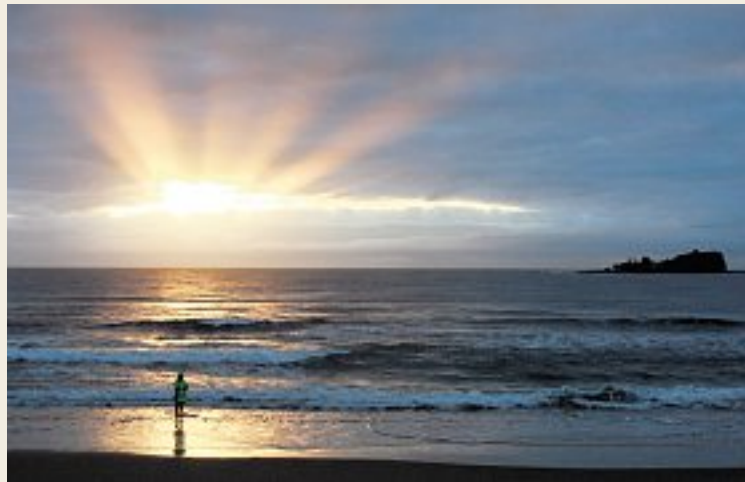
PERFECT START TO DAY: Sunrise at Mudjimba Beach.