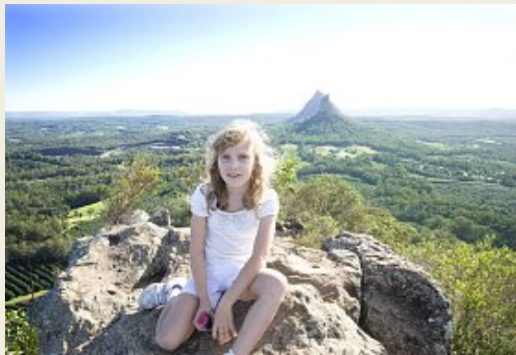
ENVIABLE OUTLOOK: A young Coast resident on top of Mt Ngungun.