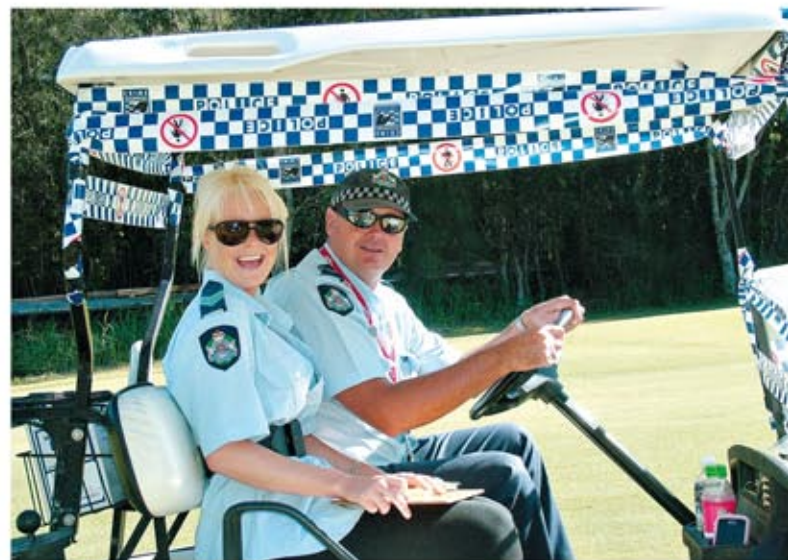
FINE TEAM: The Club Pelican Kops do the rounds to issue 'fines' to players to raise funds to fight Motor Neurone Disease.